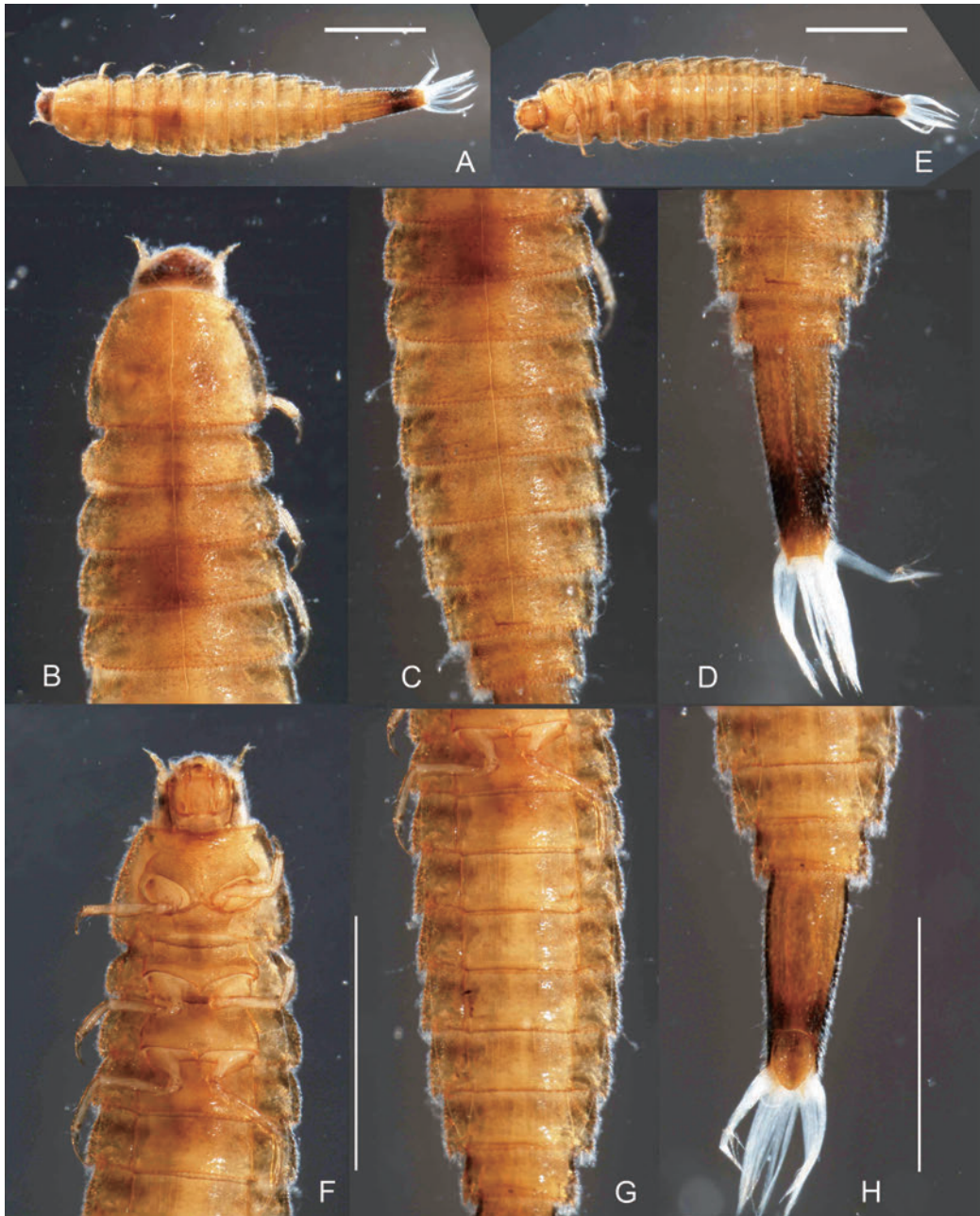
Fig. 1. Larva of Leptelmis torikai . A-D. dorsal view; E-G. ventral view. Scale bar = 1.0 mm.